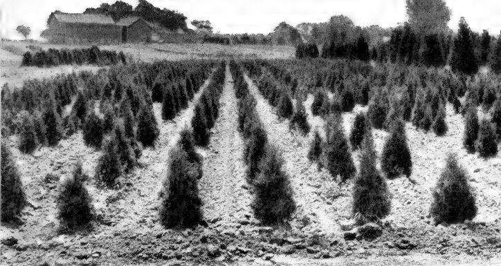
Thuja occ. pyramidalis 4 ft.